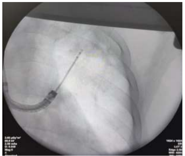
Figure 5. The biopsy sample was taken by C-arm fluoroscopy guided bronchoscopy at the left B2 segment.

No active bleeding was found. A sample to be examined was taken by bronchial washing, brushing, and forceps biopsy (Figure 5). The sample is checked for histology, cytology, and KOH smear. The results can be seen in Figure 6.