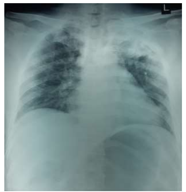
Figure 2. Chest radiography revealed opacity and hilar restriction in the left upper lobe

The patient was conscious, oriented, and hemodynamically stable when examined. Pallor was present. Low vesicular breathing was discovered during a respiratory system assessment in the left hemithorax region. Examinations of the nervous system, heart, and abdomen were all normal. Initial blood tests revealed severe anemia with a hemoglobin (Hb) level of 6,0 g/dL. Xpert MTB-RIF Assay G4 did not detect Mycobacterium tuberculosis . Chest radiography is shown in Figure 2.