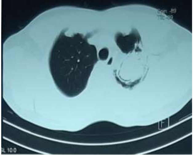
Figure 3. Suspicious aspergilloma shown in chest CT scan

Rifka Wikamto: C-Arm Fluoroscopy-Guided Bronchoscopic Biopsy for Diagnosing Aspergilloma With Massive Hemoptysis After Pulmonary Tuberculosis