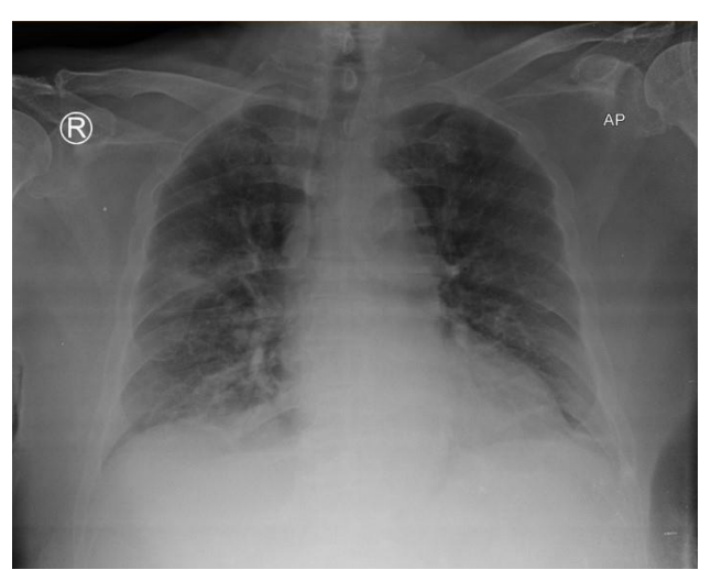
Figure 5. Chest X-Ray Followed up on clinic, one week after discharged

Figure 4 showed a decreased of infiltrates within the cavitary lesion 4 days after starting antifungal treatment. Figure 5 showed faded cavitary lesion within 1 week after discharged. He was allowed to discharge from hospital and did some follow up treatments.