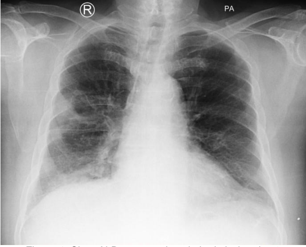
Figure 4. Chest X-Ray on our hospital admission day 8