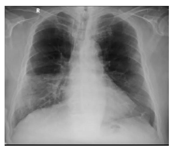
Figure 1. Chest X-Ray when he first admitted for being positive for COVID-19

and hospitalized for 8 days. Later on, he was confirmed negative for COVID-19. Figure 2 is serial chest x-ray upon admission in our hospital showed worsening infiltrate followed by cavitary lesion. Past medical history is diabetes mellitus without prior infection of tuberculosis. From physical examination showed fever (37.8°C) with slightly increased respiratory rate 26/minute, and decreased peripheral saturation (92%).