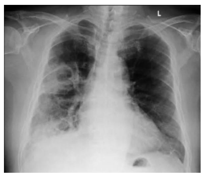
Figure 2. Chest X-Ray on current state, showed areas of consolidation with cavitation in right mid and lower lobes

Rales were present on auscultation on mid and lower zones of right lung. He showed no oral candida and showed no respond on antibiotics (based on his previous prescription). Laboratory investigation showed leucocytosis with WBC count of 11.8/mm<sup>3</sup>